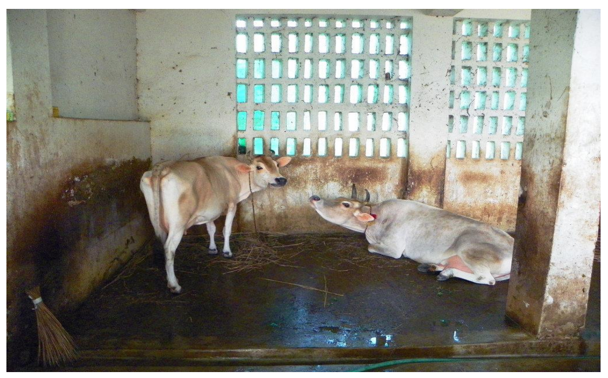
Photo: New stock arrive awaiting the dairy completion - October 2018

Most importantly, the project expansion will continue to multiply benefits as it enables the dairy farm to become fully self-sufficient and to reach the goal of providing a steady income stream to assist with teacher wages.