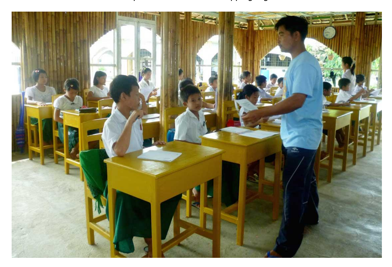
Teacher placement at the Nazareth Bush School, deep in the forest of Myuangmya, Myanmar.