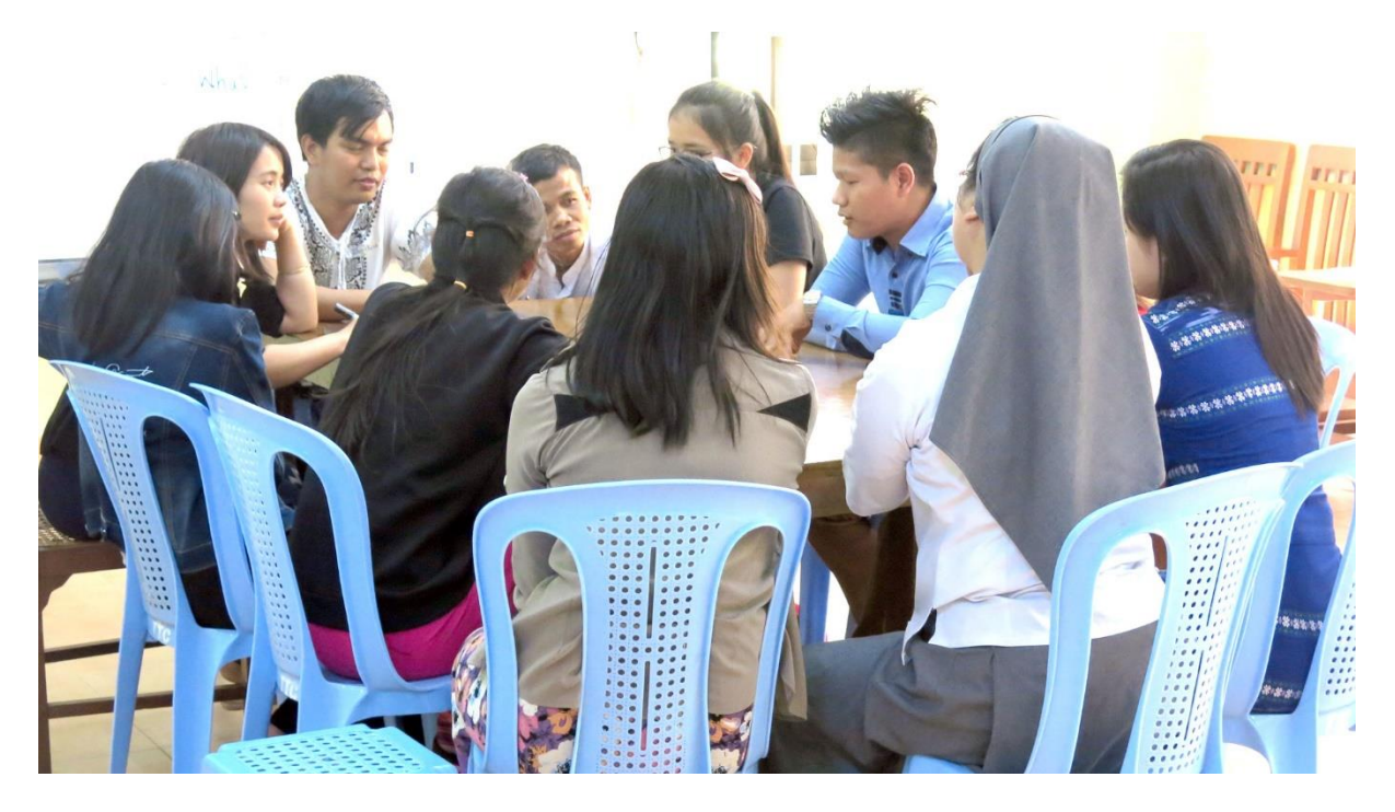
PSIE diploma students workshopping together