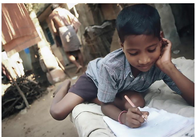
Student at the Beatrix School