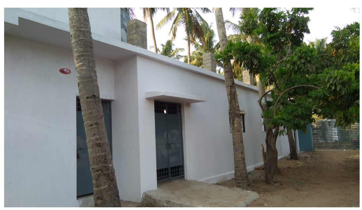
The new dairy including power room, storage room and shop - December 2018