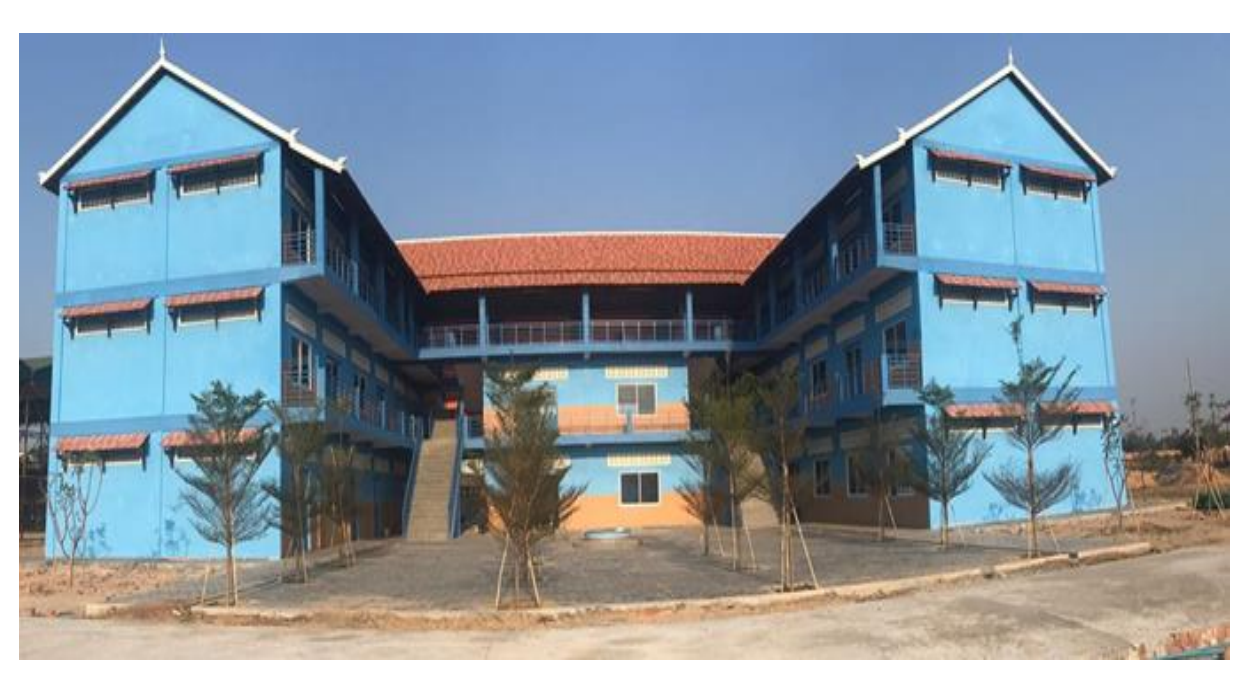
Completion of the new St François Technical Campus

The students are learning sustainable agricultural procedures for them to adapt to best modern practices, which will assist them, their families and their communities into the future. This will be only the sixth technical and agricultural high school in the country. Funds from the Teachers Helping Teachers Program contributed towards the costs of building new classrooms, material, curriculum development and teacher training.