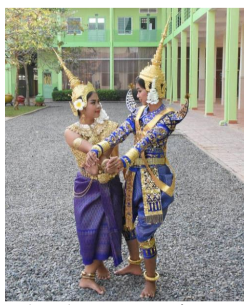
St François students perform Khmer dance at opening of new training facilities - January 2019

As a Teachers Helping Teachers Partner , your fortnightly contributions have assisted rural students enrolled at St François Technical High School to gain valuable knowledge and skills to find gainful employment particularly in agriculture and emerging tourism related occupations.