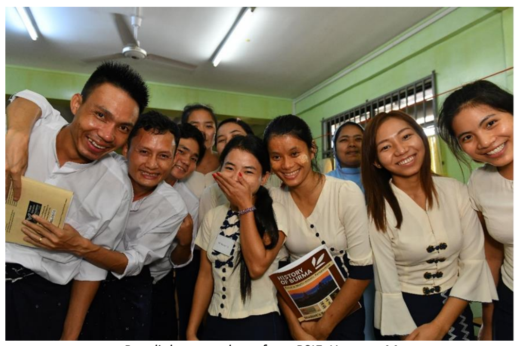
Pre-diploma students from PSIE, Yangon, Myanmar