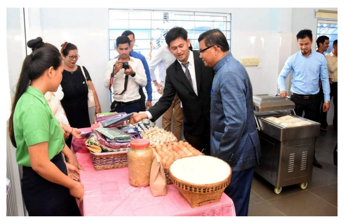
Students\ displaying\ produce\ and\ textiles\ produced\ at\ Phnom\ Voah\ Agricultural\ Farm